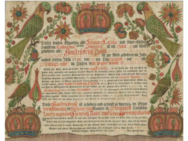
The Stopp Collection contains hundreds of birth and baptismal certificates for German Americans, from the 18th century to the 20th.

Archival photos, letters, and diaries, as well as company records from midwestern businesses, can yield powerful details about our ancestors.